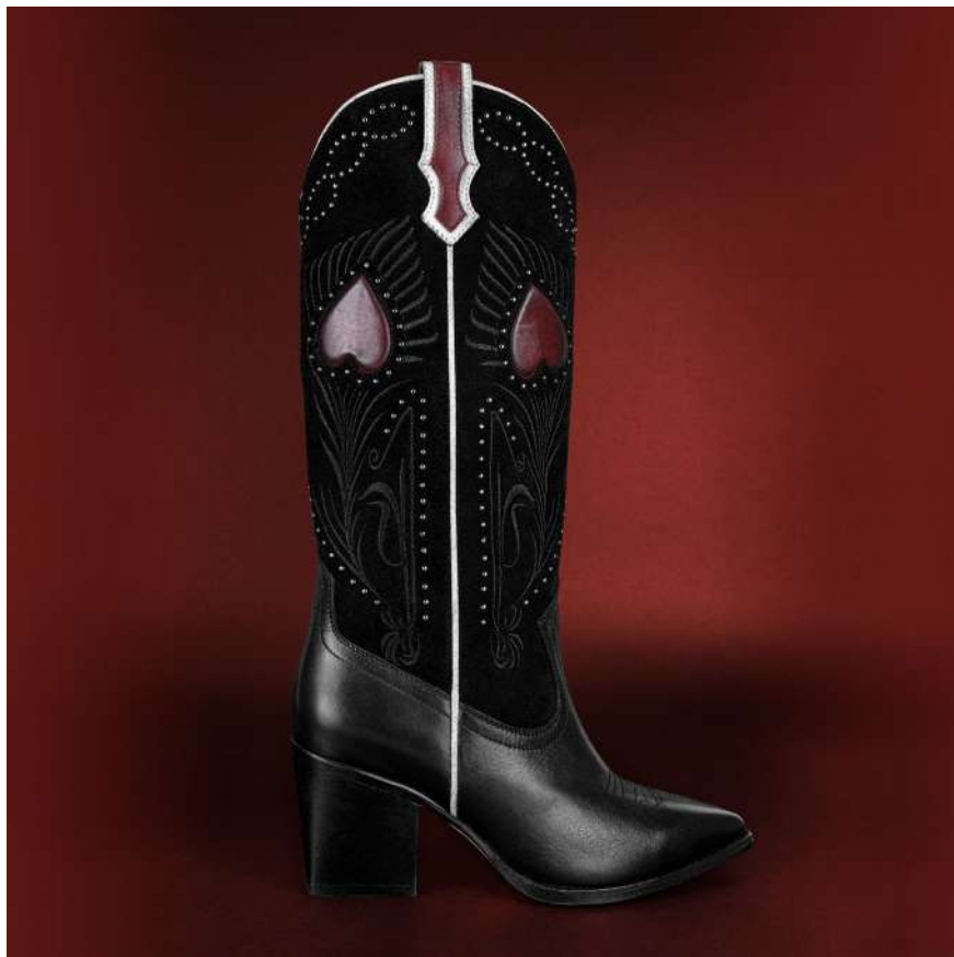
Fiore Black Suede