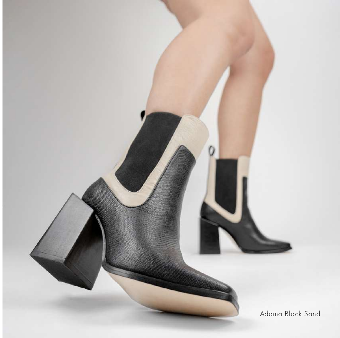
Adama Black Sand