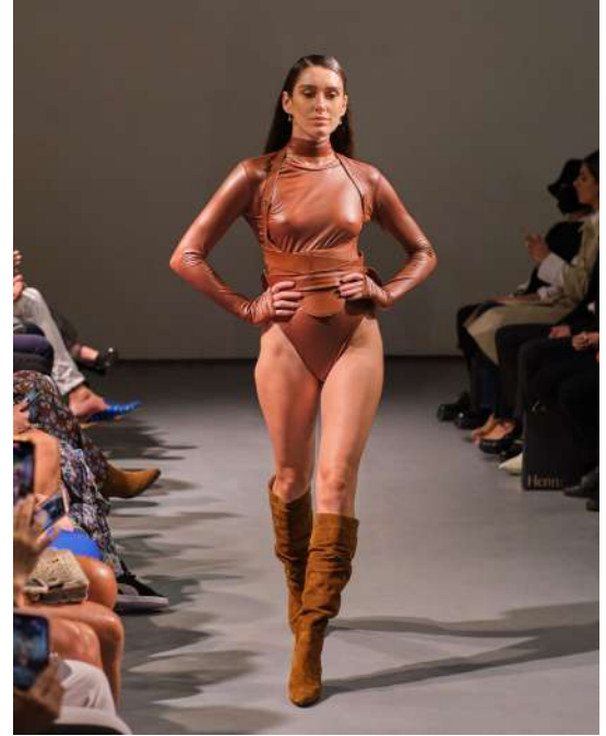
Fall 21 NEW YORK FASHION WEEK Boundless Collection