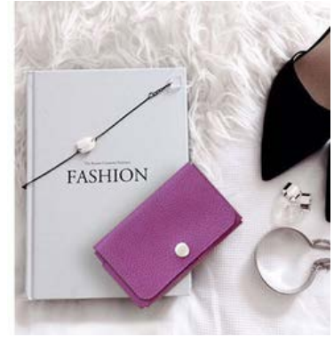
Card holder wallet

Designed to carry ID, cards, Visa, money, immigration forms, and, of course, your passport. Its convenient rear access allows you to use your passport without exposing or losing other important documents.