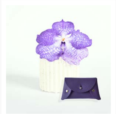
Trapezoidal card holder

Keep your AirPods Pro safe and close at hand with this leather case designed for maximum protection and style. Equipped with a metal strap to attach to your bag or keychain, it offers a practical and stylish solution for taking your headphones with you wherever you go.