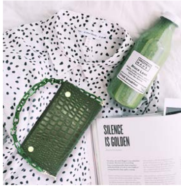
Cell phone holder with hand strap

The perfect accessory for carrying your phone, money, cards, and keys, this compact design features rear access that allows you to use your smartphone without having to open your wallet, protecting your privacy. Includes a complimentary keychain.