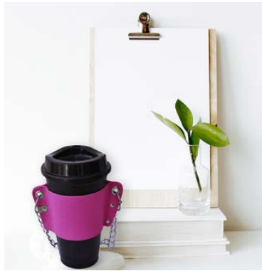
Large glass cover

Designed to let you enjoy your coffee without worrying about burns, this elegant leather cup holder is the perfect accessory for carrying your favorite beverage. Carry your coffee in style and convenience, without compromising your comfort.