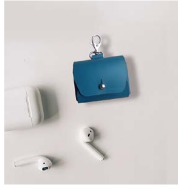
Protective case for AirPods

This square wallet with a practical magnetic closure is the ideal solution for carrying your coins easily and stylishly. Its innovative design allows you to open it easily, access your coins without the risk of them falling out, and close it with a simple movement.