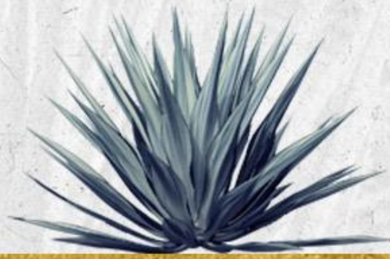
JIMA - AGAVE HARVESTING