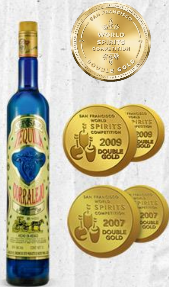
San Francisco world Spirits competition 2007 Double Gold Tequila Corralejo Reposado.