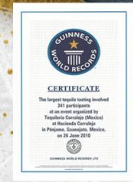
Guinness world records The largest tequila tasting, 2010