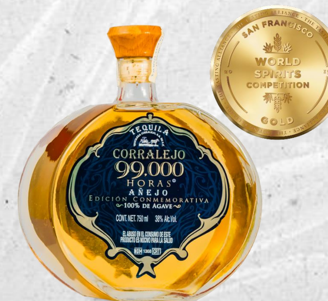
San Francisco world Spirits competition 2019 Gold Tequila 99000