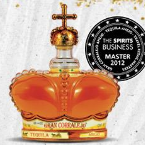
The Spirits Business Master 2012 Gran Corralejo Añejo.