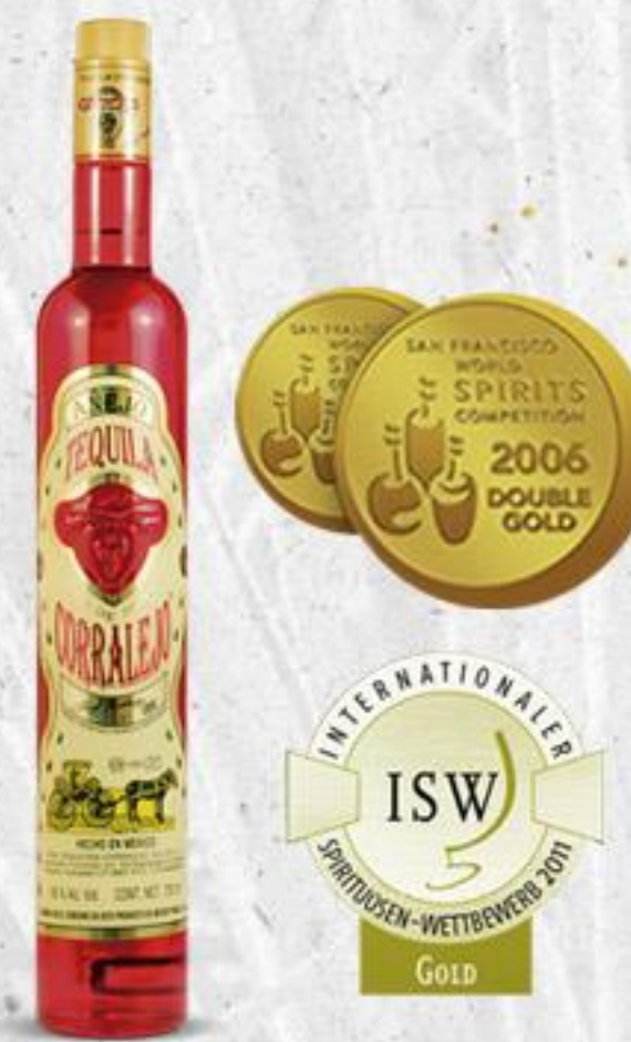
San Francisco world Spirits competition 2006 Double Gold Tequila Corralejo Añejo.