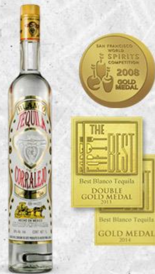
San Francisco world Spirits competition 2008 Gold Tequila Corralejo Blanco.